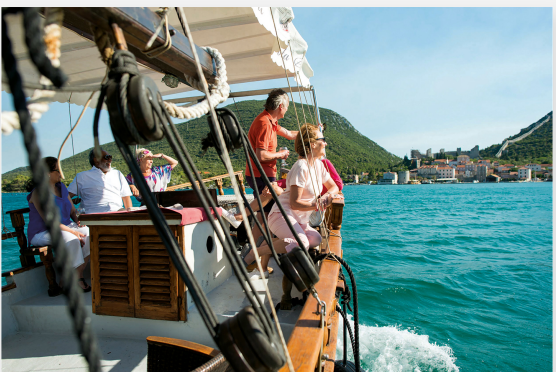
COUNTRY ROADS OF CROATIA