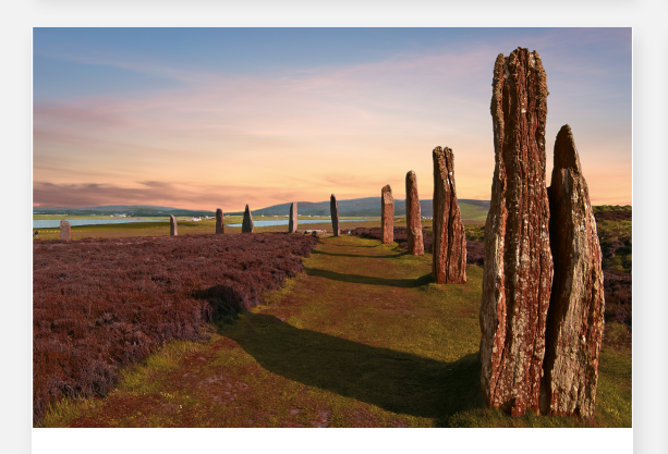
BRITAIN & IRELAND EXPLORER