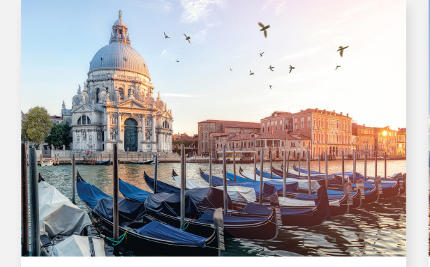
BEST OF ITALY