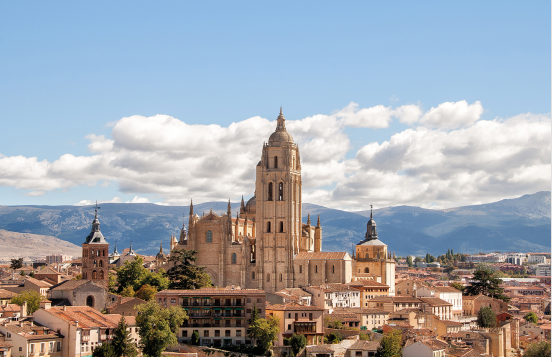
EASY PACE SPAIN