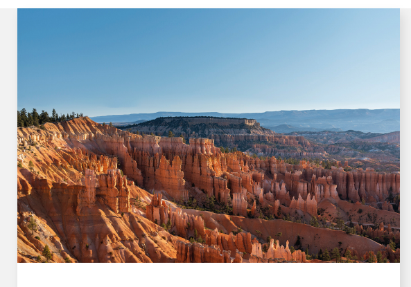
WONDERS OF THE AMERICAN WEST

Get up close and personal with the breathtaking natural beauty of the North and the vibrant metropolitan cities and cultures of the South as you discover the Americas - in early bird style.