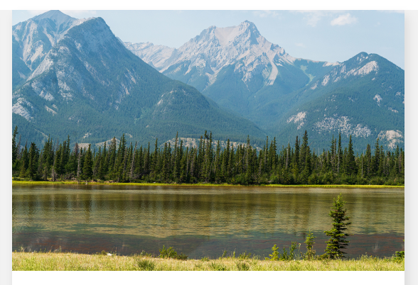
CANADIAN ROCKIES & PACIFIC COAST